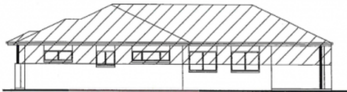
DIRECTION - A. BRACING REQUIRED 61.8 sqm x 0.72 kPa/sqm = 44.5 kN FORCE.