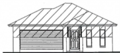
DIRECTION - B. BRACING REQUIRED 30.6 sqm x 0.77 kPa/sqm = 23.6 kN FORCE.